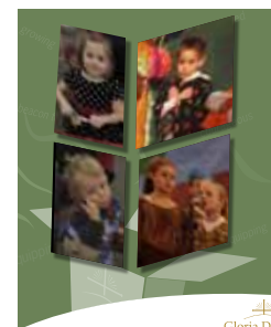
2010 Holiday Opportunities

Remember to turn your clocks back one hour as we return to Central Standard Time.